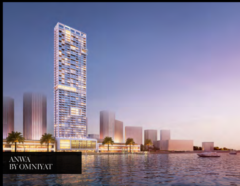
ANWA BY OMNIYAT