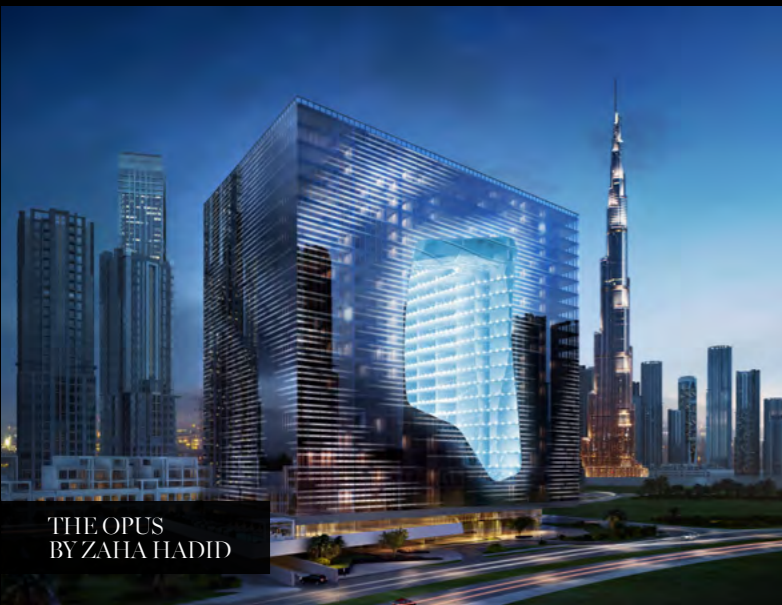
THE OPUS BY ZAHA HADID