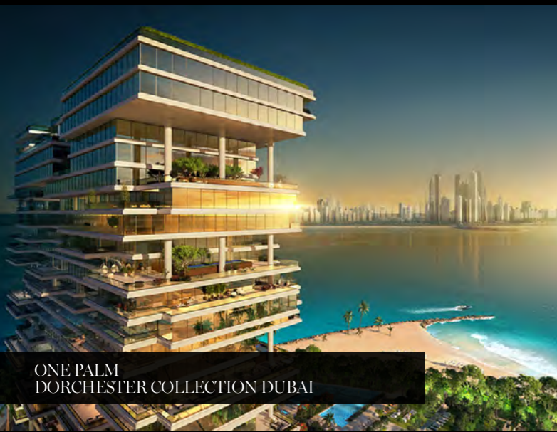
ONE PALM DORCHESTER COLLECTION DUBAI