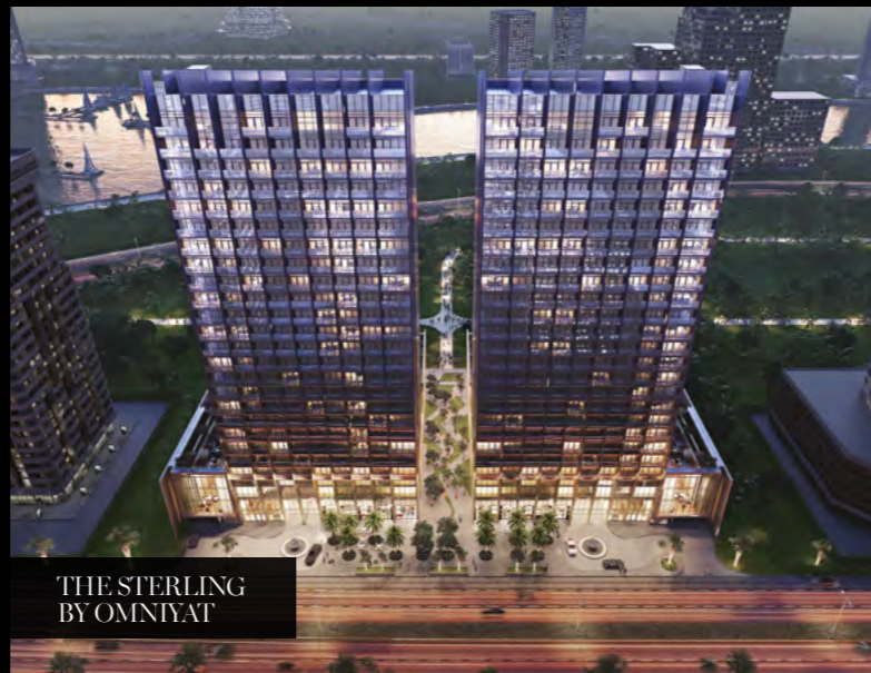
THE STERLING BY OMNIYAT

One of the most visionary real-estate development and service groups in the Gulf Region, Omniyat creates living canvases of residential, commercial, hospitality and retail spaces – a one-of-a-kind premium experience. We approach the design, development and management of each Omniyat property as if it were a unique work of art. Just as there is no mistaking a Picasso or a Van Gogh, there is no mistaking that you are anywhere but in an Omniyat property.